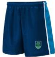
PE Shorts £12.95