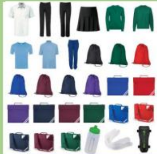
PLAIN SCHOOLWEAR, BOOK BAGS AND ACCESSORIES