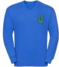
V Neck Sweat from £14.95