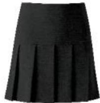
Skirts From £10.25