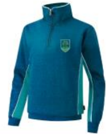
¼ Zip PE Top £25.00